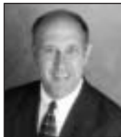
Jim Doyle, Governor State of Wisconsin, Madison, WI "AODA in Wisconsin: What We Need Now" (Scheduled)

May 9, 10, and 11, 2005 • Sheraton Madison Hotel • Madison, Wisconsin